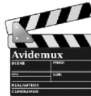
Video Editing Application