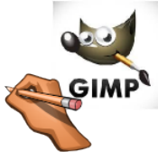
Image Manipulation Application